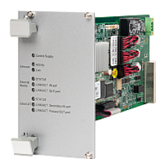
Motion controller module