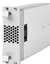
Power supply module