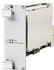
2-axis drive module

The user can select the power supply configuration, the type of each of the four drive modules, its current and which voltage (48Vdc or 96Vdc) to feed it and a motion controller and EtherCAT master. Consult ACS for availability.