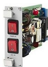
Power management module